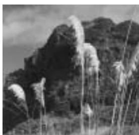
Native Toi-toi grass

How to tell the difference between pampas and the native toi-toi: The native Toi-toi, shown here, belong to the same genus as pampas grass – Cortaderia (from the Spanish – cortadero – something that cuts!), but it is not hard to tell the difference. Note the way these flower heads curve or droop – whereas pampas (see above) are very upright. For other differences and information see the Landcare section of the Karekare website, or turn up for a demonstration on 9 March! Weed bags available from Caroline Grove (8128-760).