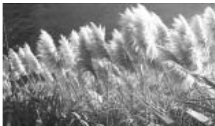
Recent picture taken in sanddunes on northern end of beach 01 March 2003

Pampas (Cutty Grass) - Cortaderia selloana and Cortaderia jubata . Pampas, one of the larger members of the grass family, is an introduced plant from South America which is a very efficient coloniser and can eventually replace native plants on wetlands, sand dunes, stream banks, coastal cliffs and roadsides, it can also invade pasture and gardens. The large clumps which form can harbour vermin and increase fire risk. The wind blown seeds can cause respiratory problems. Both types of pampas are to be found in Karekare. The purple pampas ( C. jubata ), shown below, is the most prolific, particularly in the Auckland area, and therefore, is the worst problem. It has the pinky/purple flowers and is to be seen on roadsides and in large clumps